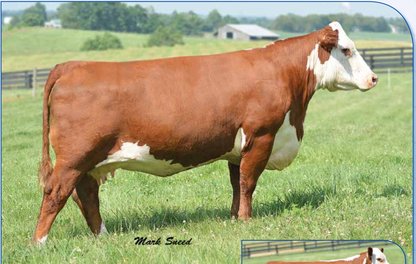
Lot 5 — Boyd Rachel 233 ET