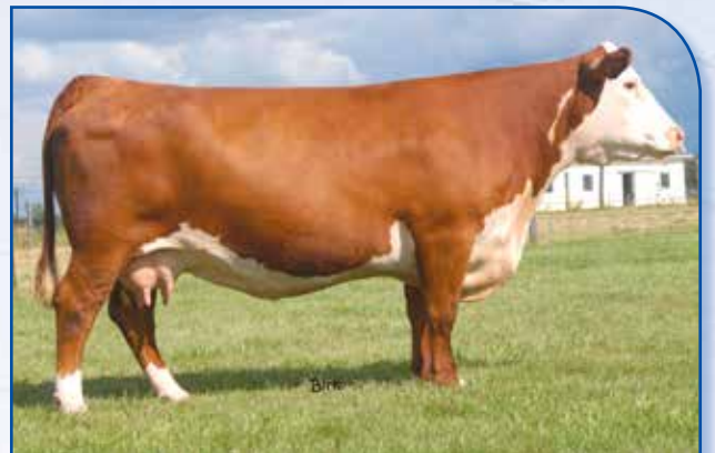
MSU TCF Rachael ET 54N — Dam of Lots 26A and 26B, Great Grandam of Lot 27