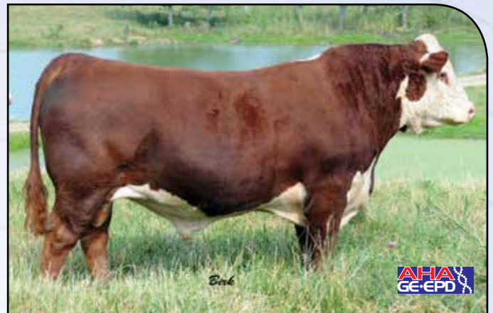
TH 22R 16S Lambeau 17Y — One of the best breeding bulls we have used. His calves are low birth, consistently high quality and good doing. His popularity will only continue to rise with time.

CE 7.8 (.34); BW -2.7 (.78); WW 21 (.69); YW 66 (.64); MM 14 (.19); M&G 24; MCE 5.1 (.27); MCW 75 (.41); SC 0.7 (.40); FAT 0.071 (.39); REA -0.06 (.40); MARB 0.29 (.35); BMI$ 19; CEZ$ 23; BII$ 17; CHB$ 14 GE_EPDs