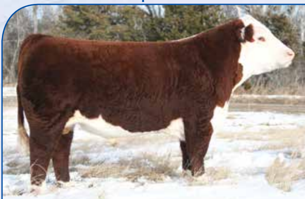
AH JDH Cracker Jack 26U ET — Grandsire of Lots 33A, 34A and 36A