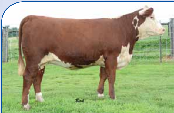
Lot 59 — SSF 43S Lady Shrek 168

CE 0.2 (.12); BW 2.9 (.31); WW 48 (.22); YW 79 (.21); MM 15 (.15); M&G 39; MCE 2.9 (.11); MCW 90 (.16); SC 0.8 (.08); FAT 0.008 (.10); REA 0.40 (.12); MARB 0.11 (.09); BMI$ 19; CEZ$ 15; BII$ 17; CHB$ 24