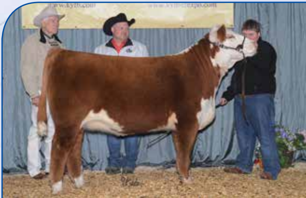
Grassy Run Queen Ten 3049 — Purchased in the 2013 Breeders Cup. Paternal sister to Lot 33A Champion Hereford Female Kentucky Beef Expo 2014