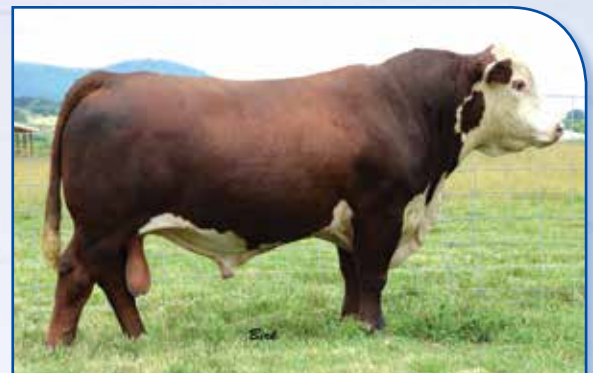
STAR Opportunity Nox 529W ET — Sire of Lot 52 and lead herd sire at Cottage Hill