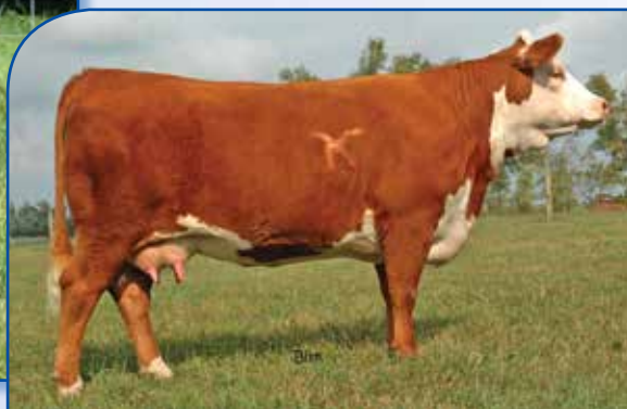
KSU Miss 6052F 308 ET — Dam of Lot 69