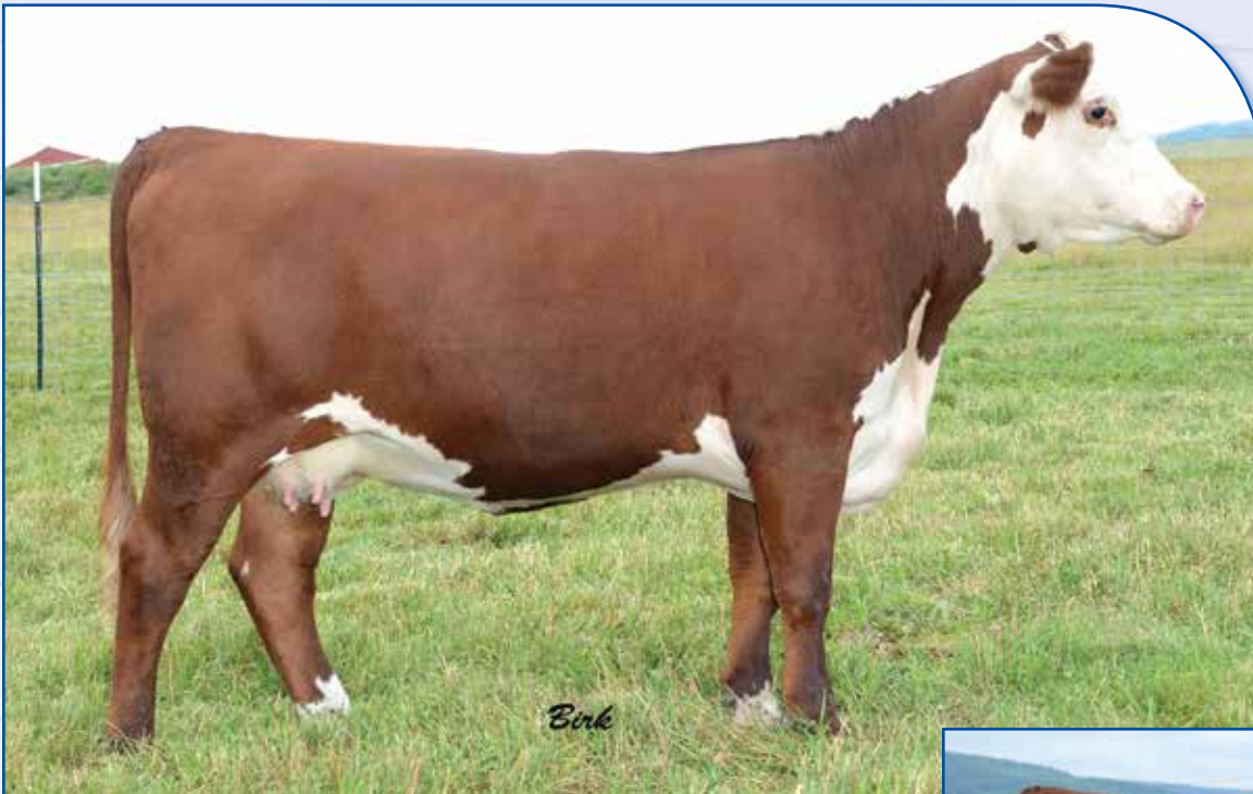
Lot 52 — CHF Lady Opportunity 207Z