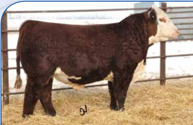
TH 71U 719T Mr Hereford 11X