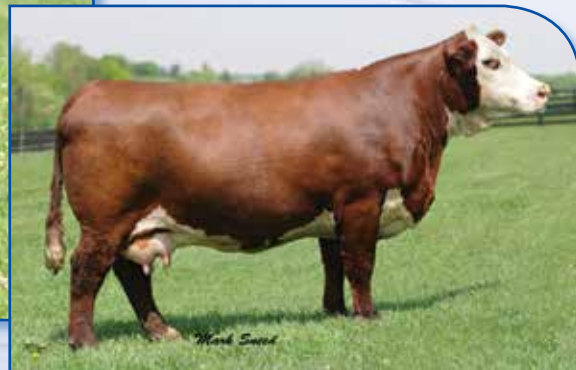
SSF P606 Ms Victor 803 — Dam of Masterpiece 0220 and Lot 8