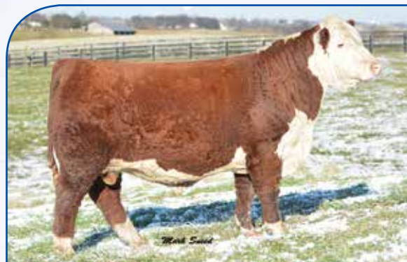
Boyd Legacy 3001 — Service sire for Lots 47 and 52

P43491316 — Calved: March 4, 2014 — Tattoo: BE B12 GO EXCEL L18 (SOD)(CHB)(DLF,HYF,IEF) DD EXCEL DESIGN 40 (SOD) H KH DD EXCEL 0091 ET (DLF,HYF,IEF) GO MS 124 ADVANCE 7005 P43110516 ANKONY MAID OF GOLD 2R (DLF,HYF,IEF) C-S PURE GOLD 98170 (SOD)(CHB)(DLF,HYF,IEF) BC WRANGLLETTE 4L MSU TCF REVOLUTION 4R (CHB)(DLF,HYF,IEF) FELTONS LEGEND 242 (SOD)(CHB)(HYF) WOLF BELLA S13 Y7 MSU TCF RACHAEL ET 54N (DLF,HYF,IEF) P43222102 WOLF P606 VICTORIA 34L S13 PW VICTOR BOOMER P606 (SOD)(CHB)(DLF,HYF,IEF) DR VICTORIA 34L