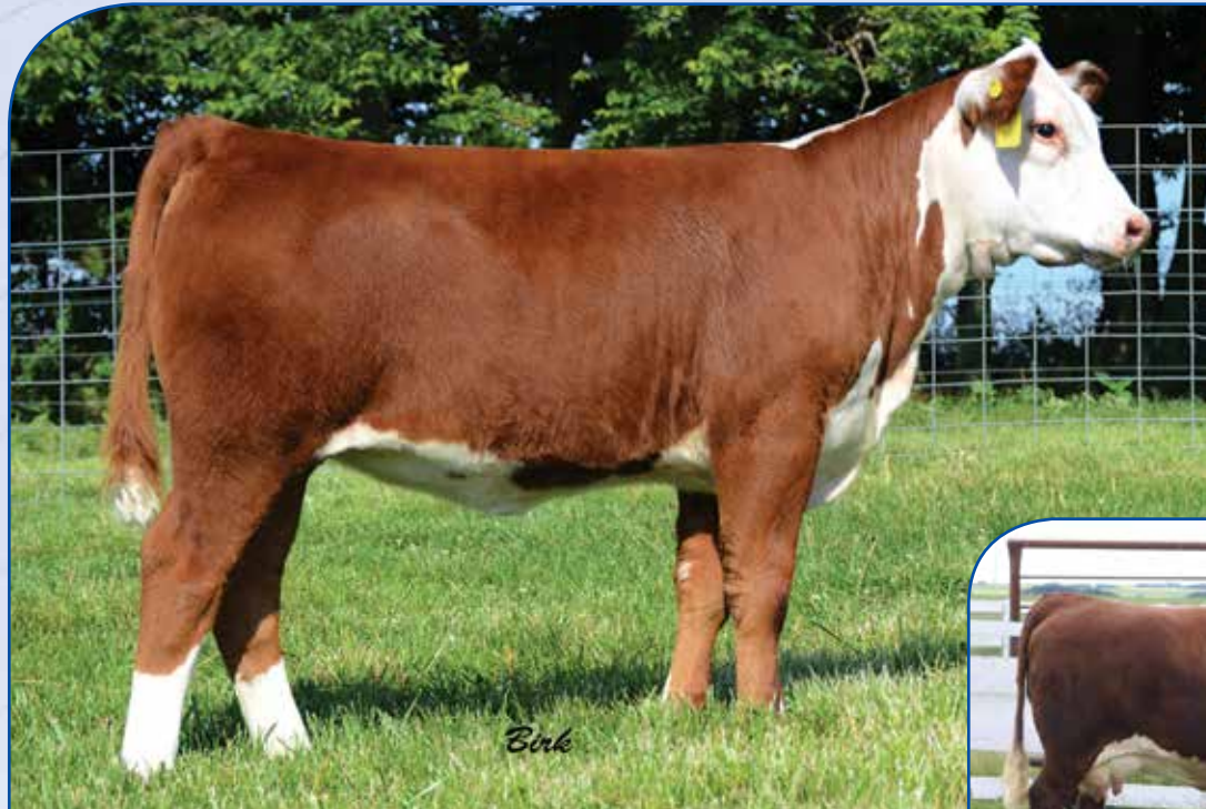
Lot 51 — HH Aria 4024