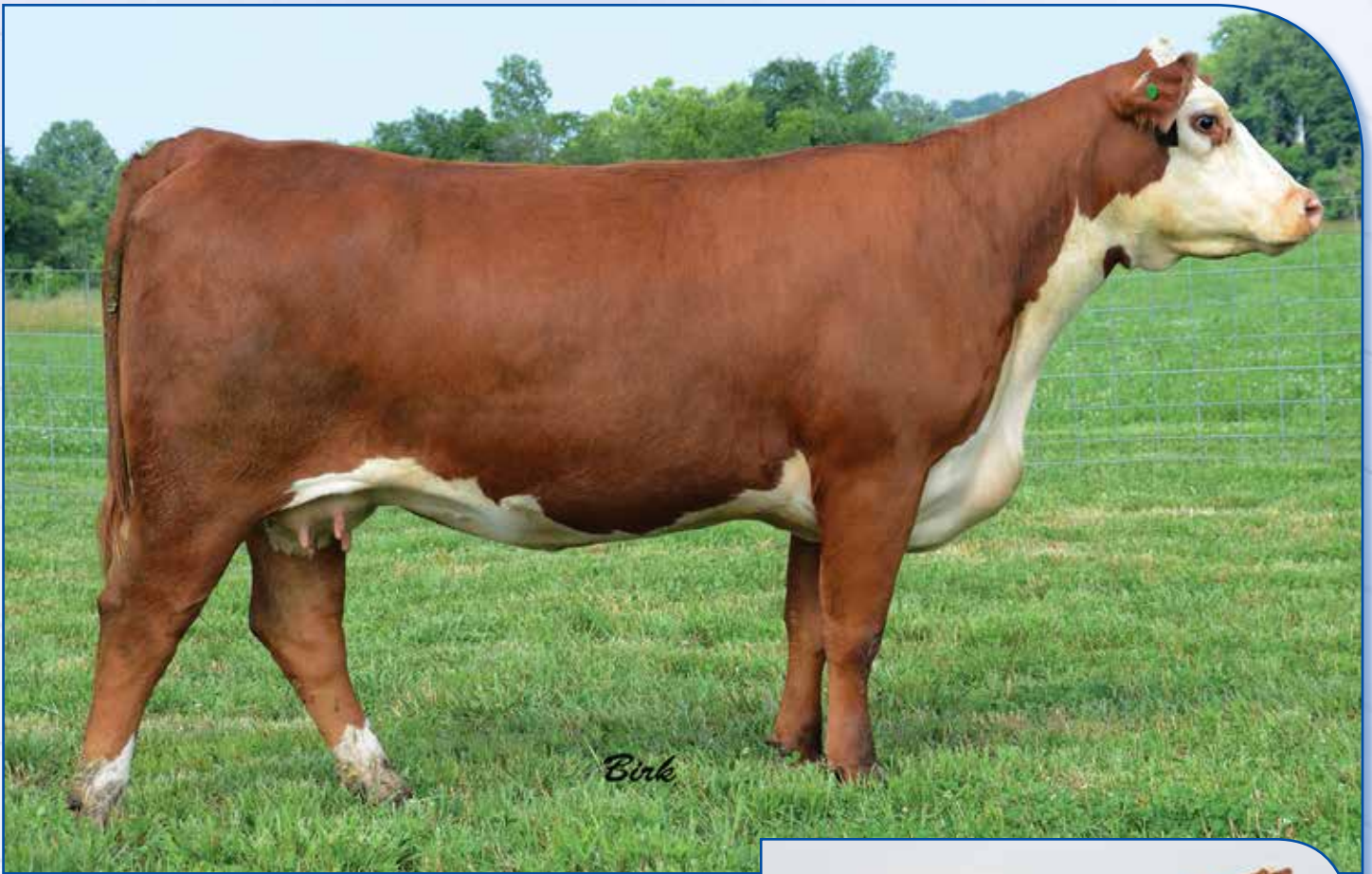
Lot 35 — Grassy Run Anchor 108Y