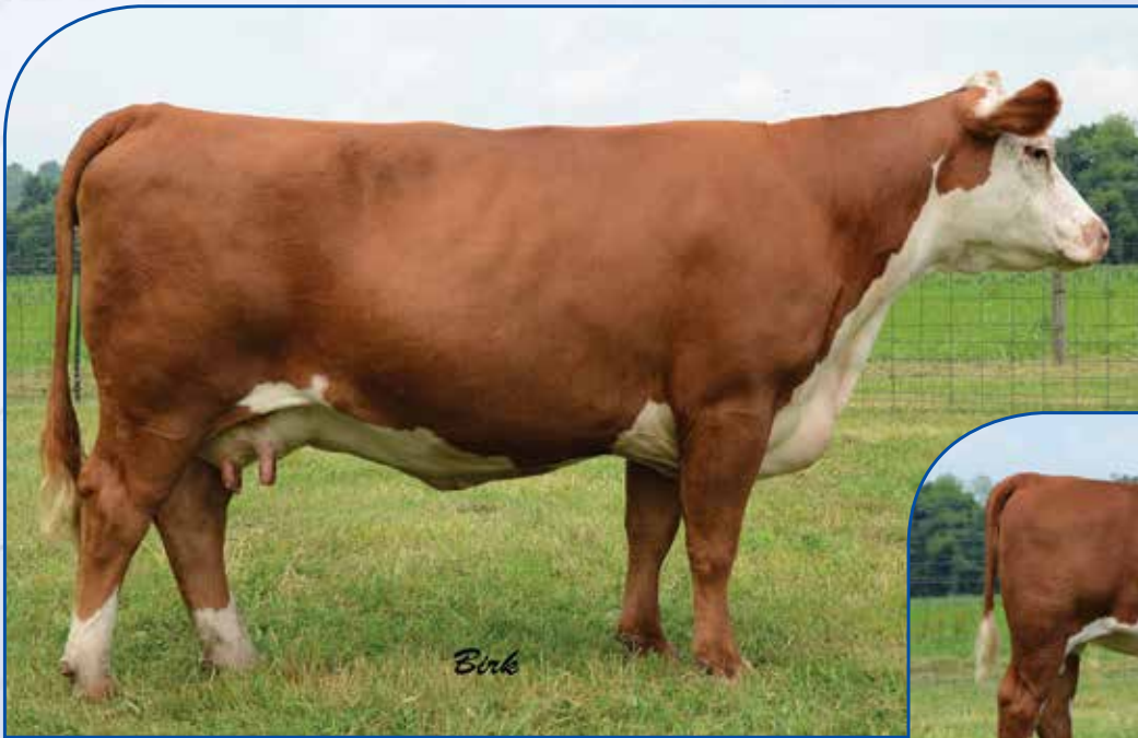
Lot 65 — FSL Miss Ribeye R117 14X