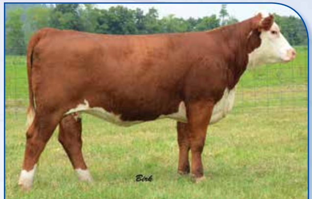
Lot 64B — FSL Lady Rev 4R 3W 8A