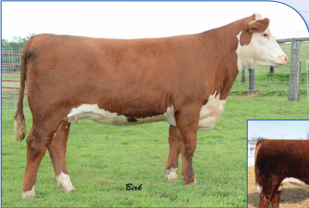
Lot 56 — SSF 4140 Ms Revolution 145