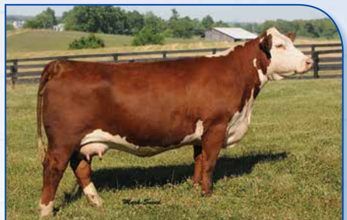
Grandview CMR Sassy X146 ET — Dam of Lot 71

THANKS FOR COMING! Your Interest and Support is Greatly Appreciated by All Involved.