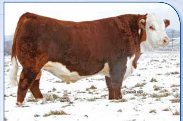
NJW 73S W18 Homegrown 8Y ET — Sire of Lot 68