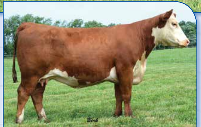
Lot 27 — Grassy Run Rachel 2001