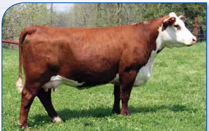
MRF Rachael 4R Z97 — Purchased as a bred heifer in 2013 by River Valley Polled Herefords in Ontario