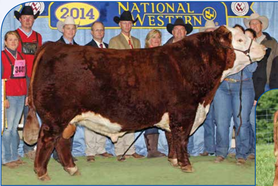
NJW 73S W18 Hometown 10Y ET — Sire of Lots 3A and 3B