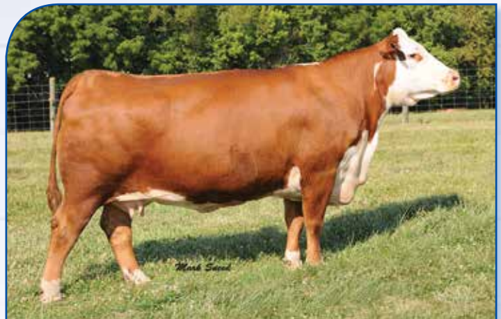
MSU TCF Rachael 22S ET —

2013 Junior National Hereford Show Senior Champion Bred-and-Owned