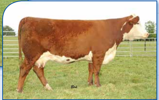
Boot Hill 533P Margarita 819 — Dam of Lot 58

CE 0.2 (.12); BW 2.9 (.31); WW 48 (.22); YW 79 (.21); MM 15 (.15); M&G 39; MCE 2.9 (.11); MCW 90 (.16); SC 0.8 (.08); FAT 0.008 (.10); REA 0.40 (.12); MARB 0.11 (.09); BMI$ 19; CEZ$ 15; BII$ 17; CHB$ 24