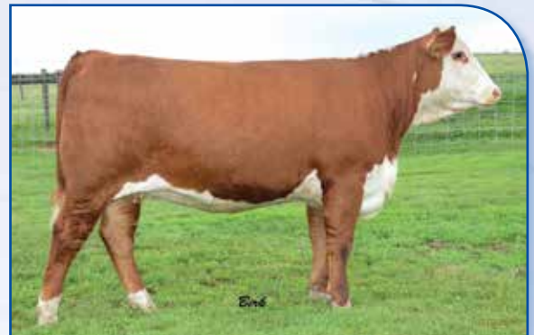
Lot 57 — SSF 418 Ms Masterpiece 169

REMITALL BOOMER 46B (SOD)(CHB)(DLF,HYF,IEF) PW VICTORIA 964 8114 (DLF,HYF,IEF) PW BAR B PHANTOM (SOD) PW VICTORIAS DREAM P718