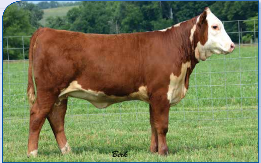
Lot 28A — Grassy Run Fairview 4009