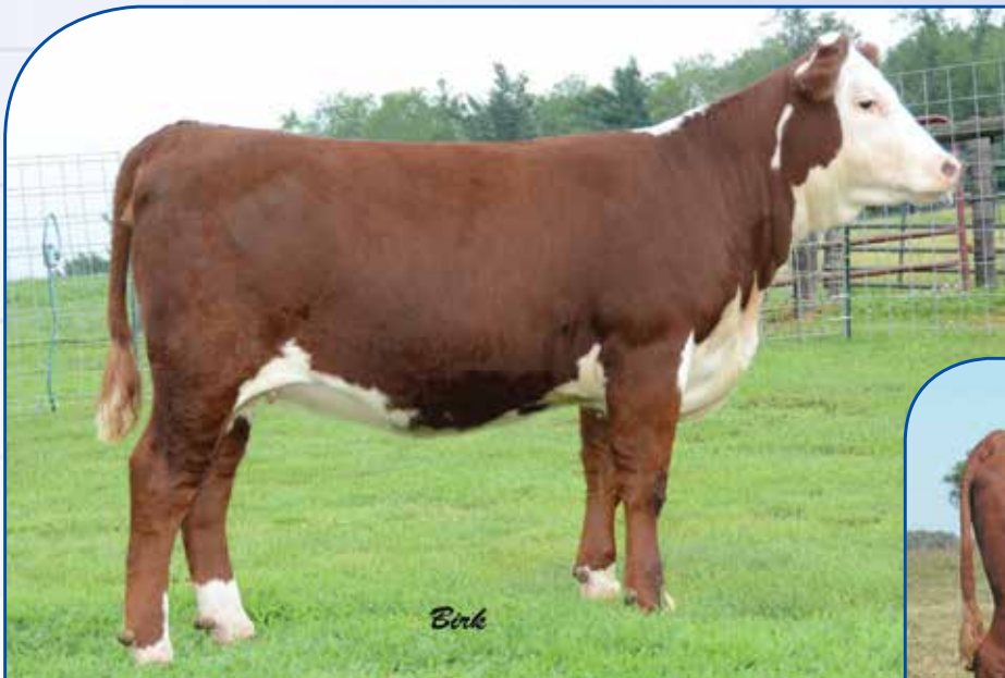
Lot 62 — SSF 7027 Lady Shrek 188