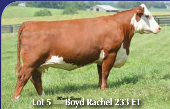
Lot 5 — Boyd Rachel 233 ET