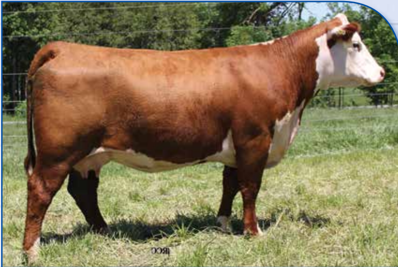
Stonewood Yoplait 2Y — Donor dam of Lot 67