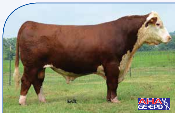
FSL Revolution 4R 29U 26Y — Featured Service Sire

CE 4.5 (.34); BW 2.8 (.47); WW 67 (.38); YW 103 (.40); MM 30 (.22); M&G 63; MCE 3.5 (.29); MCW 96 (.37); SC 1.5 (.33); FAT 0.053 (.30); REA 0.46 (.31); MARB 0.26 (.28); BMI$ 26; CEZ$ 19; BII$ 20; CHB$ 34 GE_EPDS