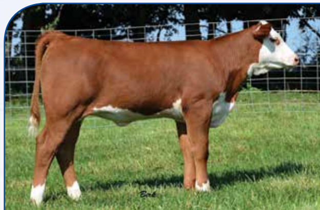
Lot 72A — ASM 70Y 0109 Stardust 430B