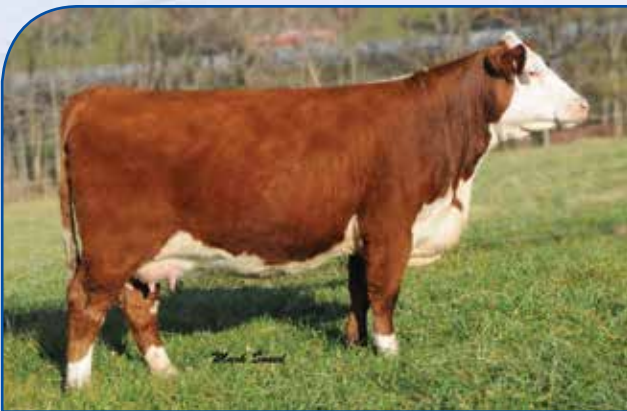
Boyd SSF Lady Shrek 072 — Donor dam of Lots 18 and 19