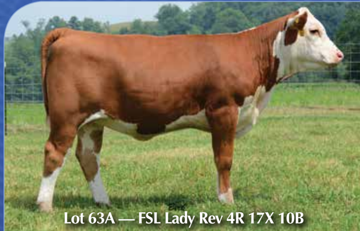
Lot 63A — FSL Lady Rev 4R 17X 10B