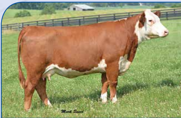
Lot 7 — G Lady Payday