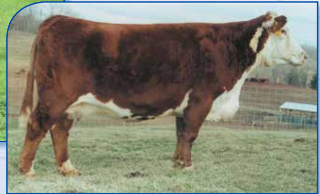
JJJ Victoria 109W 112 — Paternal grandmother of Lots 59, 60, 61 and 62