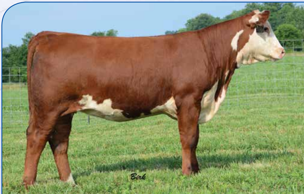
Lot 26A — Grassy Run Rachel 106A