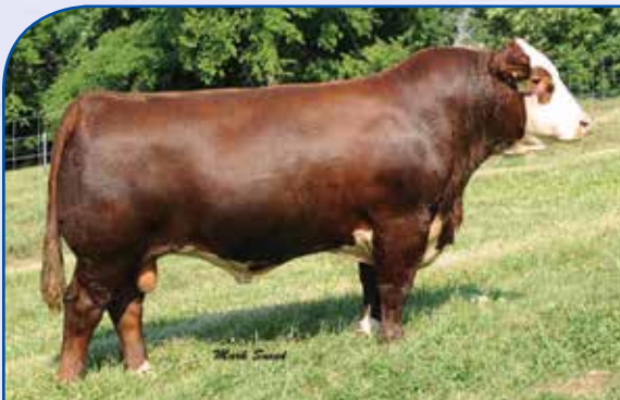
Boyd Masterpiece 0220 — Sire of Lot 4