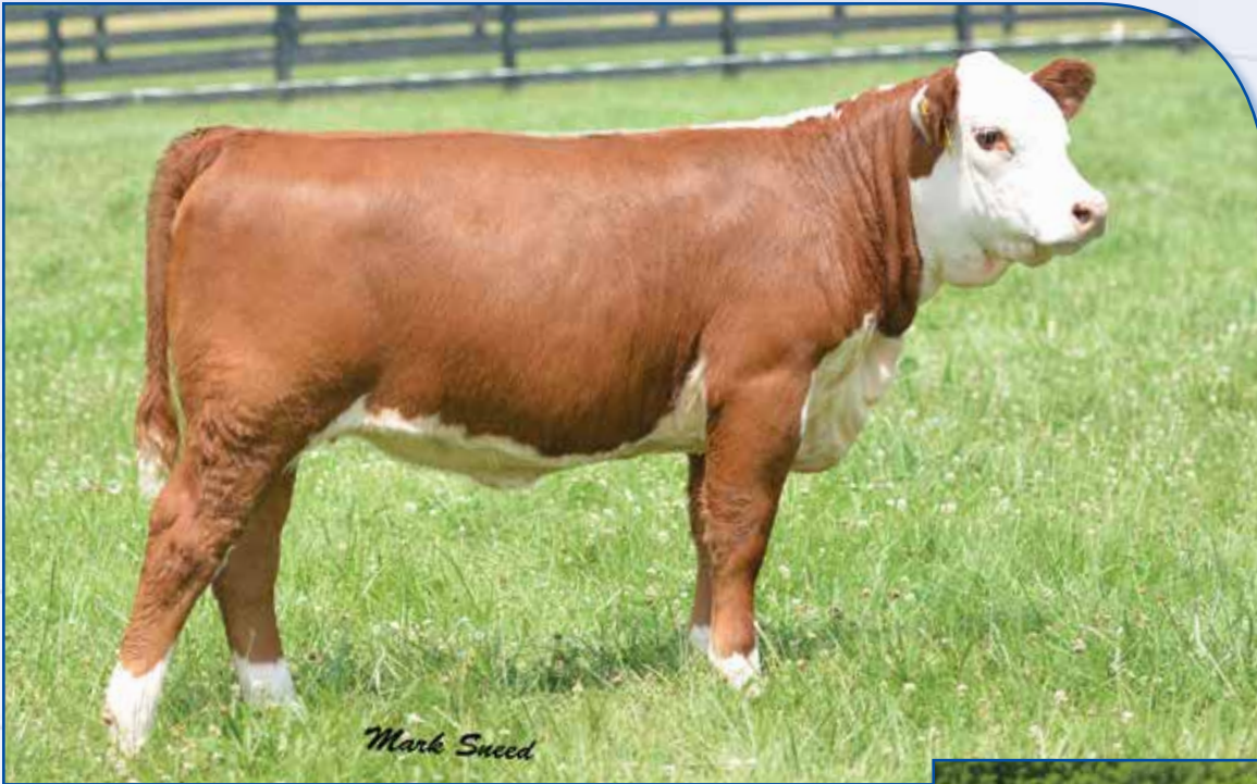
Lot 1 — Boyd Lady Masterpiece 4054