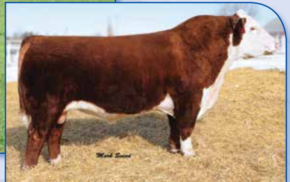
MSU TCF Revolution 4R — Featured Breeders Cup sire