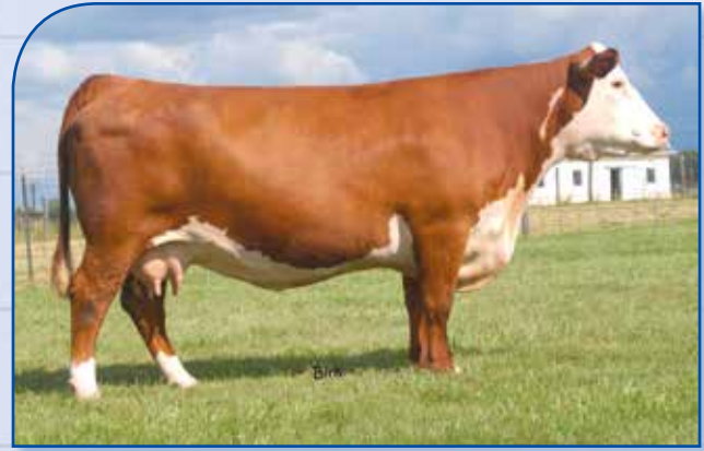
MSU TCF Rachael ET 54N — Grandmother of Lot 36