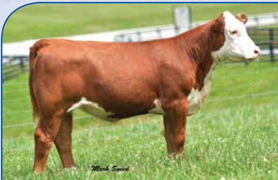
Lot 3B — Boyd 233 Rachel 3135