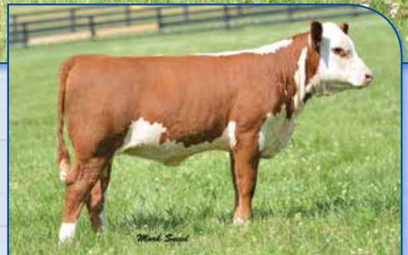
Lot 5A — Boyd Rachel 4022

FELTONS DOMINO 774 (SOD)(CHB)(DLF,HYF,IEF) FELTONS G15 REMITALL ONLINE 122L (SOD)(CHB)(DLF,HYF,IEF) HH MISS ADV 786G 1ET