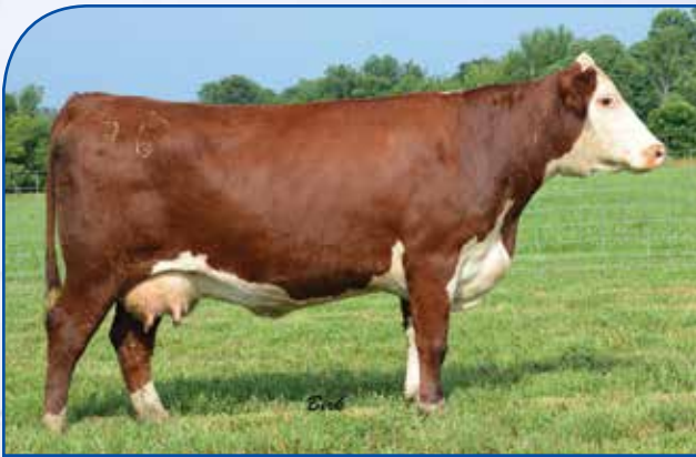
Lot 42 — NJW 45T 63J Kodi 3W