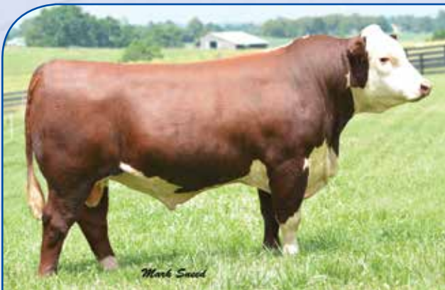
Boyd Complete 4R 2117 — Jr. Herd Sire. His dam is phenomenal

CE 0.6 (.49); BW 3.3 (.86); WW 55 (.78); YW 81 (.76); MM 26 (.21); M&G 53; MCE -0.3 (.37); MCW 75 (.46); SC 0.2 (.61); FAT -0.014 (.52); REA 0.62 (.52); MARB -0.07 (.49); BMI$ 10; CEZ$ 12; BII$ 7; CHB$ 25 GE_EPDs