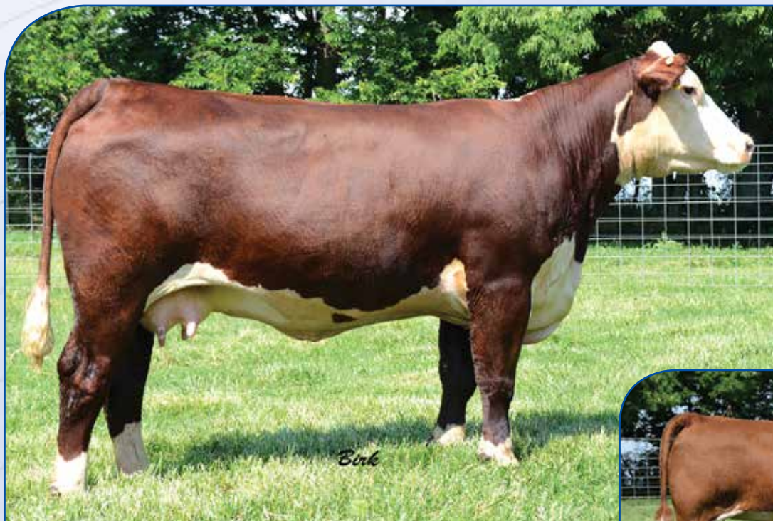
Lot 47 — WOLF Bella S13 Y7