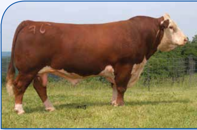
NJW 8E 120J Embassy 81S ET — Sire of Lots 36 and 37