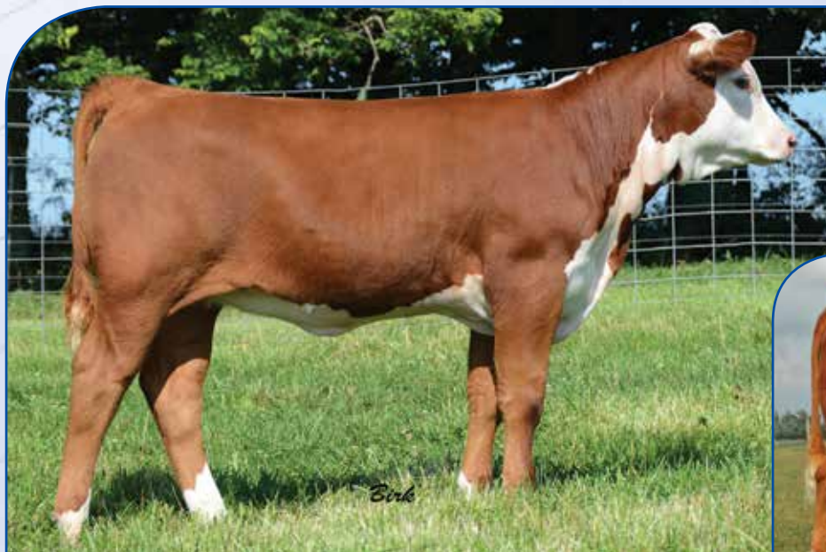
Lot 69 — ASM 308 100W Miss Adair 429BET