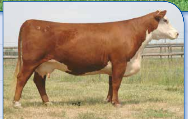
Anchor 33L — Donor dam of Lot 35