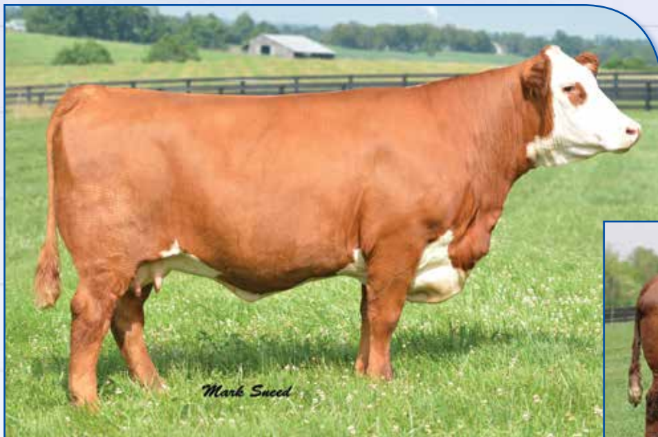
Lot 8 — Boyd 803 Holly 1090 ET