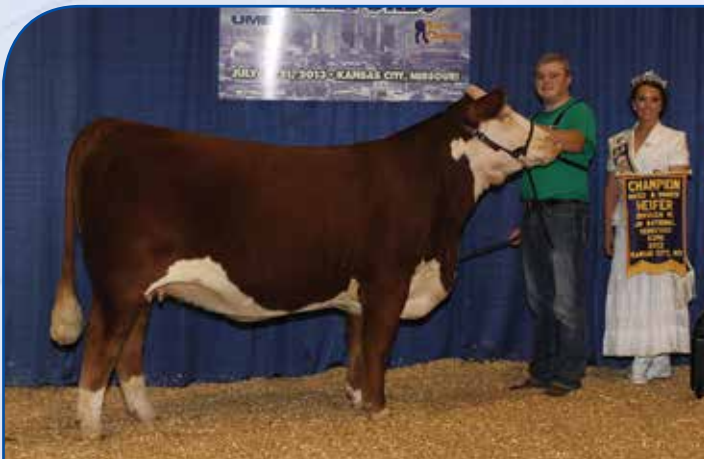
Boyd 22S Rachel 1151

2013 Junior National Hereford Show Senior Champion Bred-and-Owned