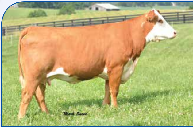
Lot 6 — Boyd Miss World 2008