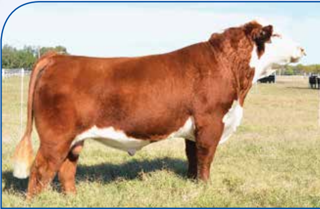
KCF Bennett Influence Z80 — Special service sire