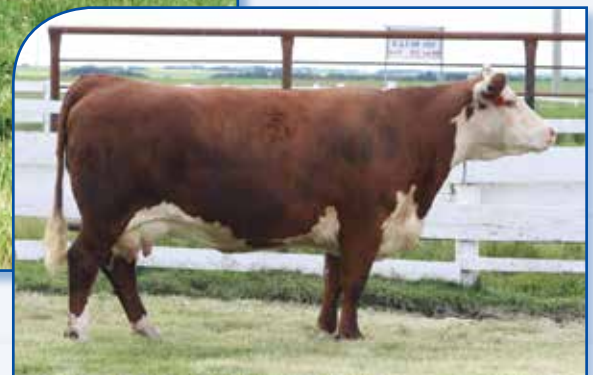
Remitall Rita 91H —

Dam: CE 3.7 (.20); BW 2.4 (.38); WW 59 (.31); YW 77 (.33); MM 27 (.19); M&G 56; MCE 3.9 (.18); MCW 70 (.28); SC 0.6 (.18); FAT -0.019 (.26); REA 0.40 (.25); MARB 0.13 (.24); BMI$ 19; CEZ$ 18; BII$ 14; CHB$ 3