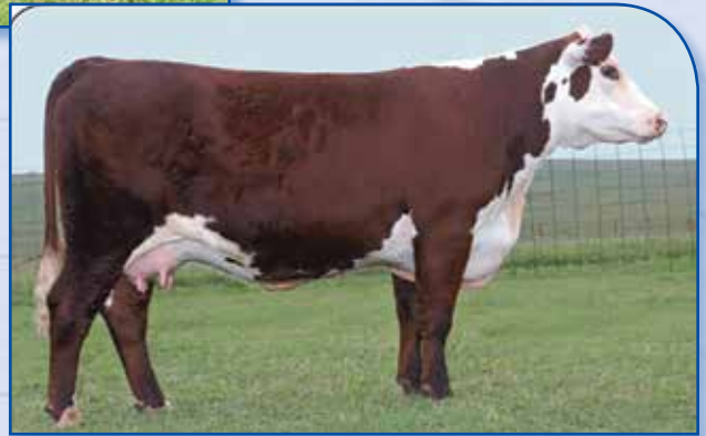
Gerber 774 Rosy Lane 623S — Donor dam of Lot 31