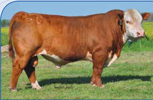
NJW 98S R117 Ribeye 88X ET — Elite sire of Lot 17