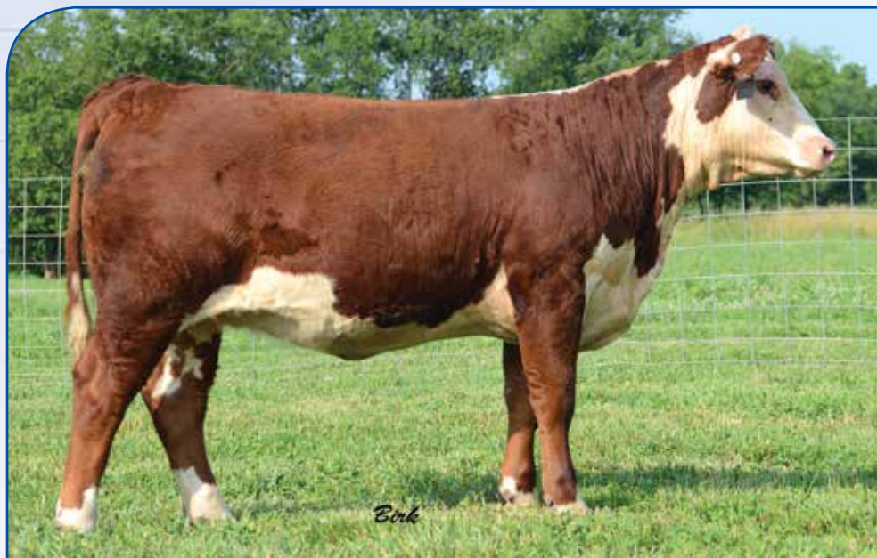
Lot 26B — Grassy Run Rachel 107A