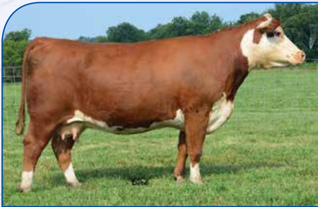
Lot 33 — Grassy Run Mandy Moore 0028