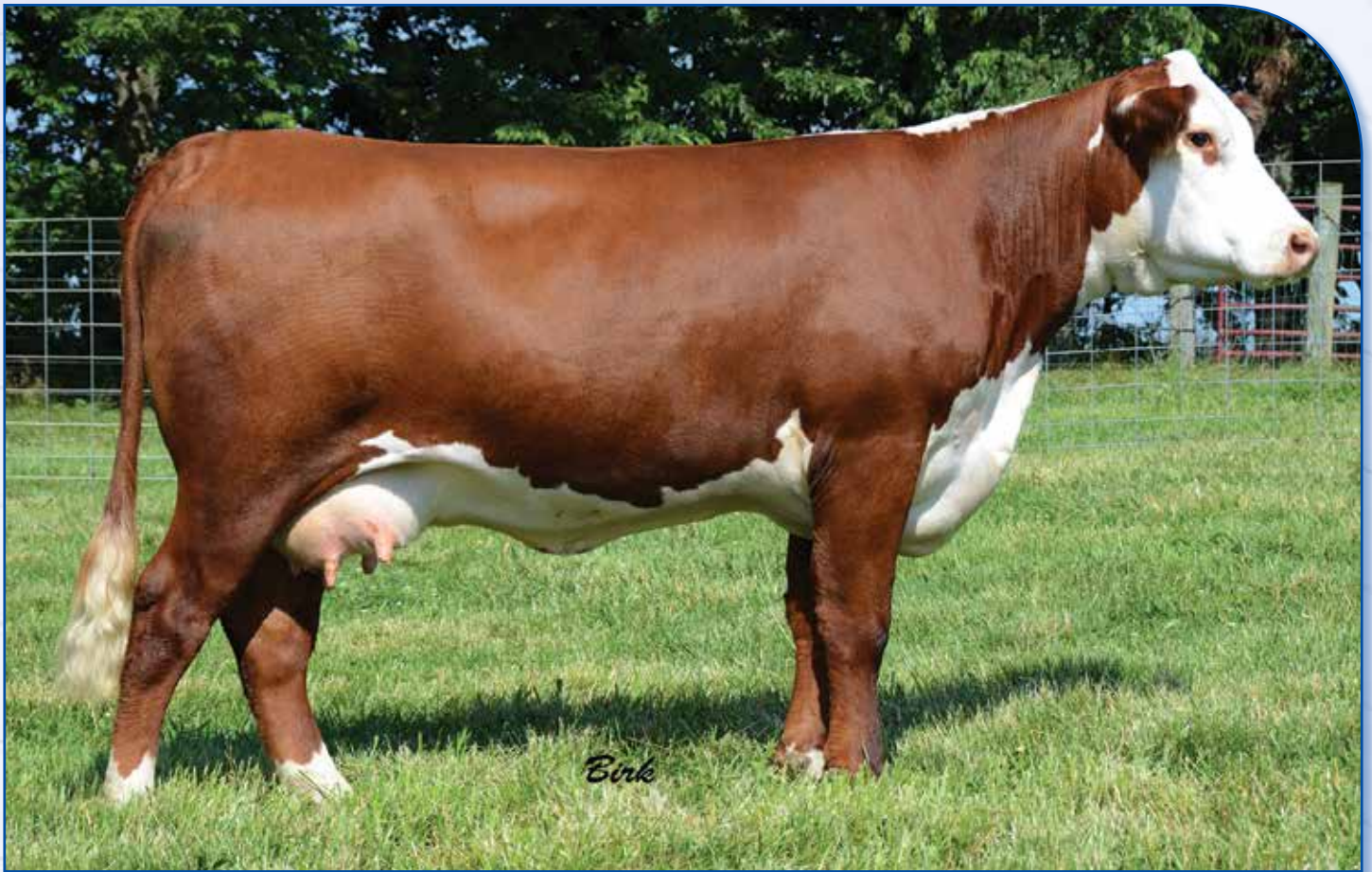
Lot 71 — ASM X146 Sassy 217Z