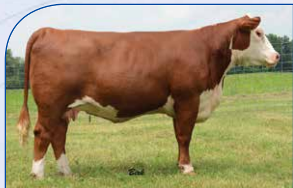
Lot 66 — FSL Revolutionary Miss 9Z

CE 2.8 (.20); BW 2.9 (.37); WW 62 (.25); YW 93 (.26); MM 27 (.18); M&G 58; MCE 3.2 (.17); MCW 83 (.24); SC 1.1 (.19); FAT 0.006 (.20); REA 0.58 (.20); MARB 0.16 (.19); BMI$ 22; CEZ$ 17; BII$ 17; CHB$ 32 • She is dark colored and quiet with perfect EPDs in the top 10% for multiple traits. Phenotypically ideal with her whole future ahead of her. • OCV