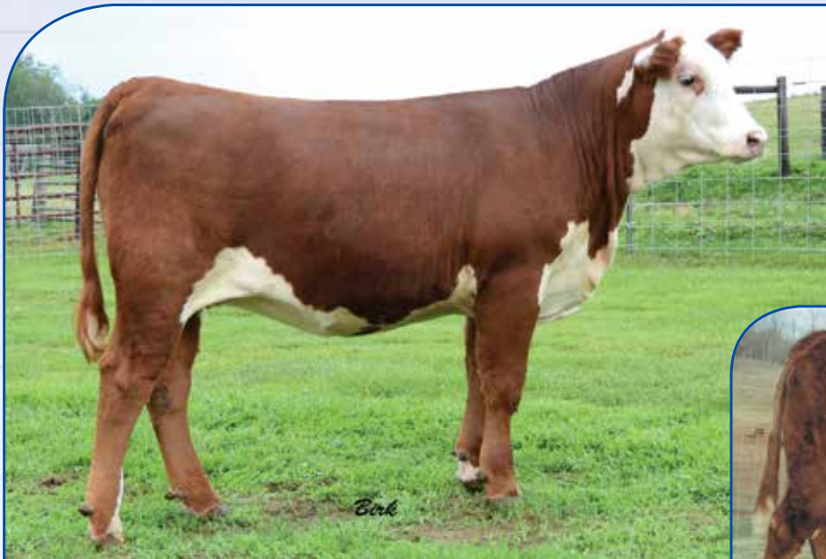
Lot 61 — SSF 503 Lady Shrek 184