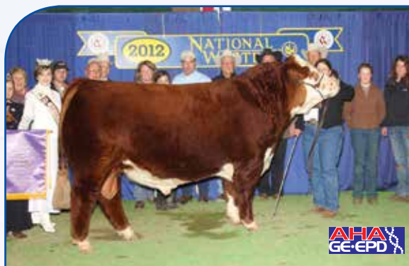
NJW 73S M326 Trust 100W ET — Sire of Lots 69 and 70B