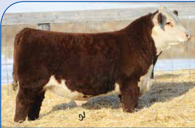
TH 71U 17Y Mountaineer 420A — Featured service sire and $230,000 top seller in Topp Herefords' 2014 sale