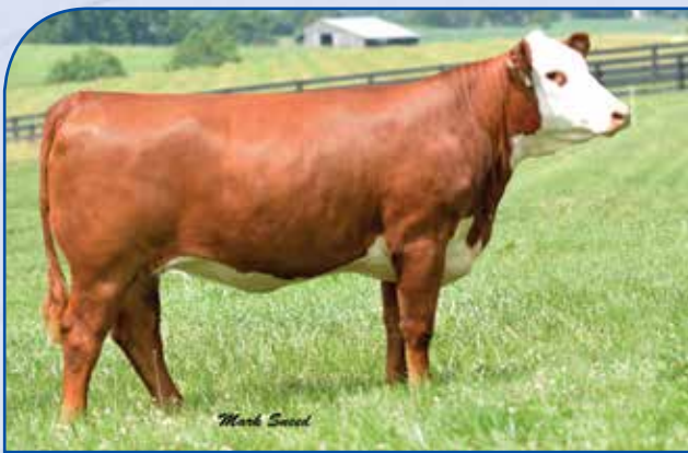
Lot 12 — Boyd Tammy 3028