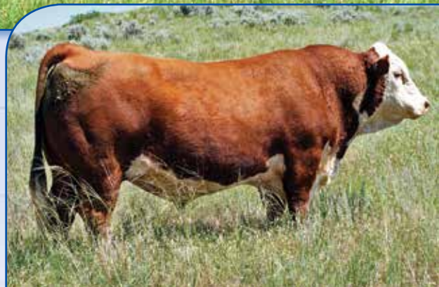
NJW 76S P20 Beef 38W ET — Sire of Lot 70A and 72