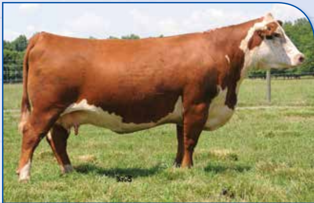
JJD Victoria 8017 ET — Dam of Lot 39