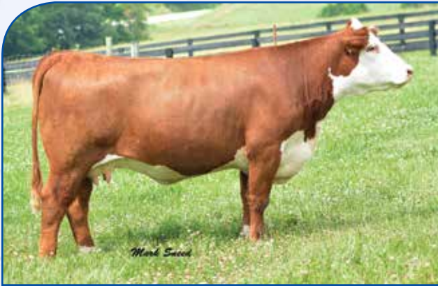
RVP 100W Liza 24Z — Donor dam of Lot 22