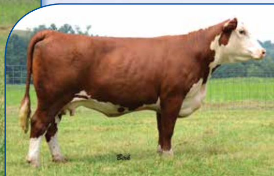
Lot 63 — FSL Easy Girl 6052 17X ET