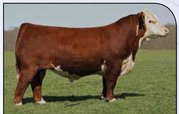
TH 75J 243R Bailout 144U ET — Sire of Lot 5