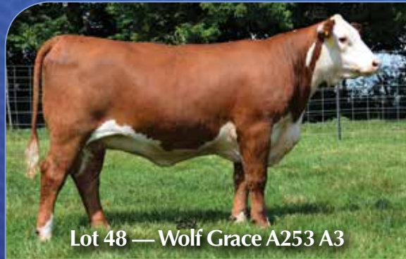
Lot 48 — Wolf Grace A253 A3