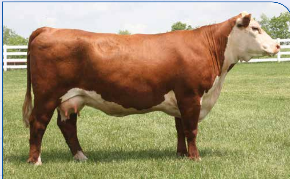
Lot 24 — DOSS Miss Revolution DHY10