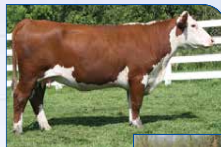
Lot 25 — DOSS Mercey Me 4R DHZ6

Doss DHZ8 — Purchased as a bred heifer in 2013 by River Valley Polled Herefords in Ontario