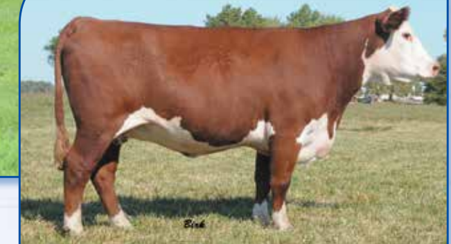
RHF Demolition F37 7027T ET — Dam of Lot 62

PW VICTOR BOOMER P606 (SOD)(CHB)(DLF,HYF,IEF) THM LASSIE DOMINO 6008 DUNWALKE DP ALPHA 324C (SOD)(DLF,HYF,IEF) DL DOMINETTE 59U