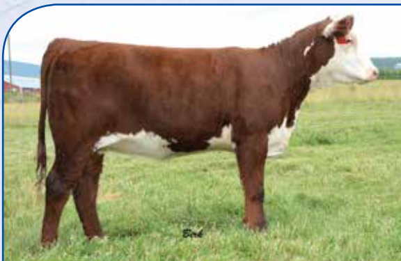
Lot 55 — CHF TTF Teardrop 3569 ET