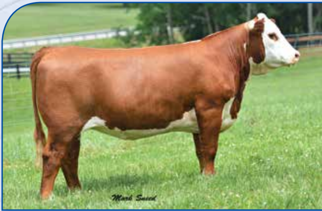
Lot 11 — Boyd Jan 3026