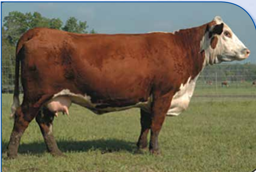
C&L NJB Belle 30N — Donor dam of Lot 68

Sire: CE -2.8 (.58); BW 3.6 (.90); WW 65 (.84); YW 119 (.82); MM 30 (.37); M&G 63; MCE 4.3 (.43); MCW 157 (.57); SC 1.4 (.61); FAT -0.043 (.57); REA 1.29 (.57); MARB 0.21 (.54); BMI$ 24; CEZ$ 13; BII$ 20; CHB$ 41 GE_EPDs Dam: CE 1.0 (.18); BW 4.1 (.37); WW 54 (.29); YW 81 (.27); MM 23 (.19); M&G 50; MCE 1.0 (.16); MCW 109 (.23); SC 0.6 (.14); FAT -0.032 (.14); REA 0.45 (.16); MARB 0.05 (.12); BMI$ 16; CEZ$ 14; BII$ 13; CHB$ 27