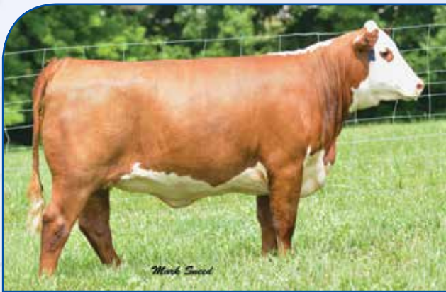
Lot 10 — Boyd Queen 3015