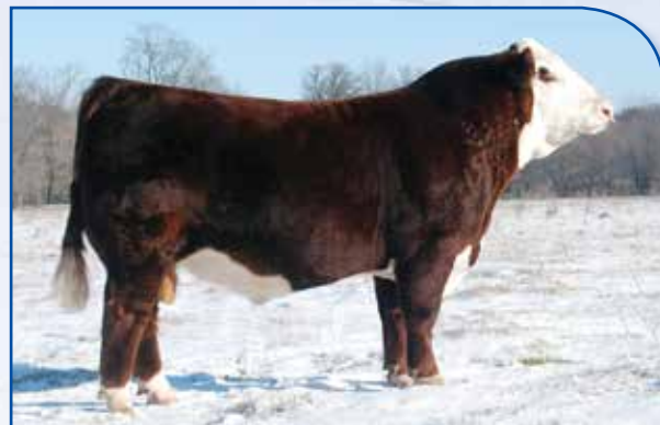
PHH PCC 812 True Grit 002 — Popular sire of Lot 8A