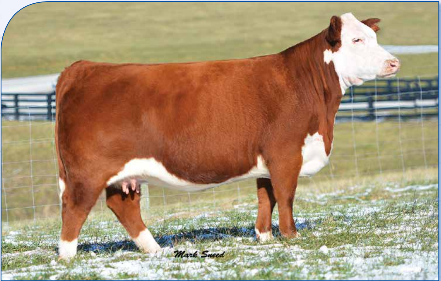
Lot 2 — Boyd 22S Rachel 1151