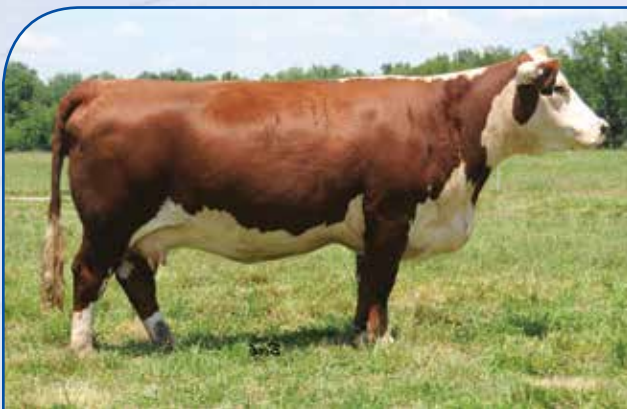
Lot 44 — THM 533P Faith 8707 ET