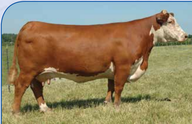
JJD Victoria Gold 2018 — National champion dam of Lot 34