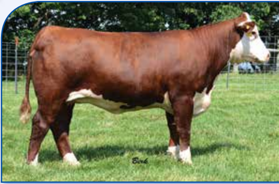
Lot 50 — WOLF Millie U11 Z28