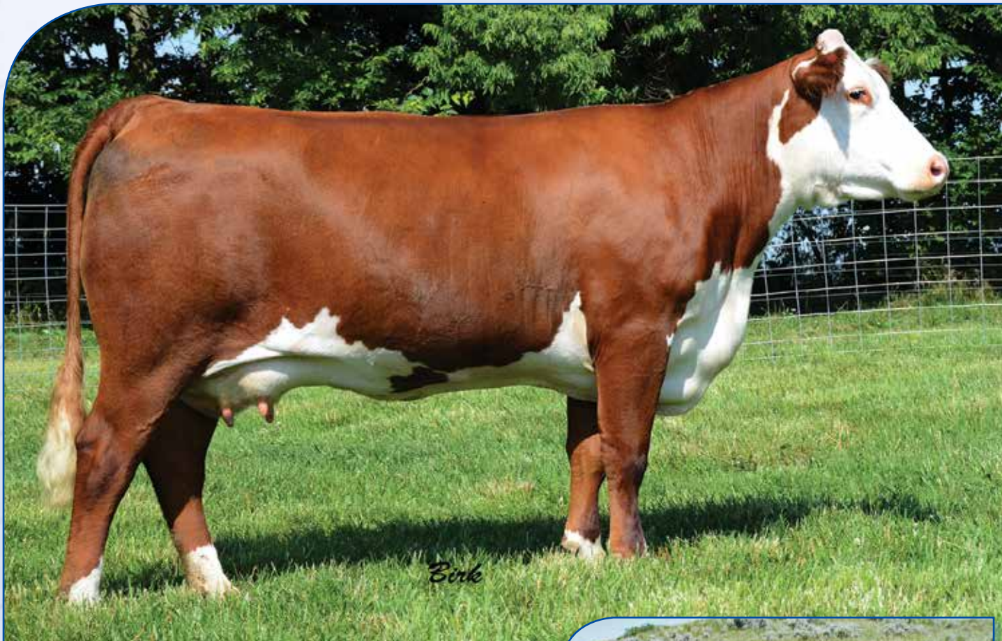
Lot 72 — NJW 1U 38W Beefy Gal 70Y