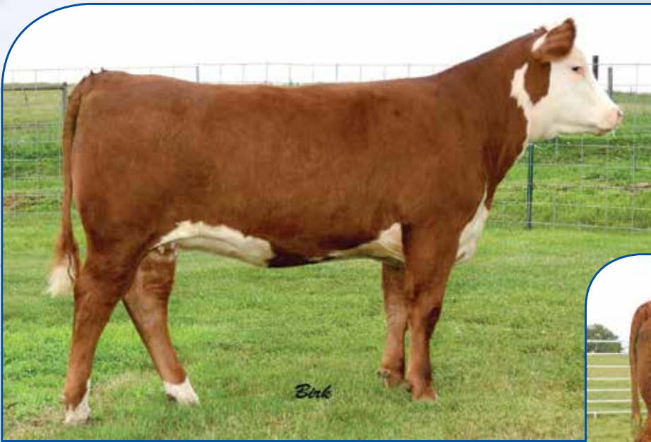
Lot 58 — SSF 819 Ms Margarita 177