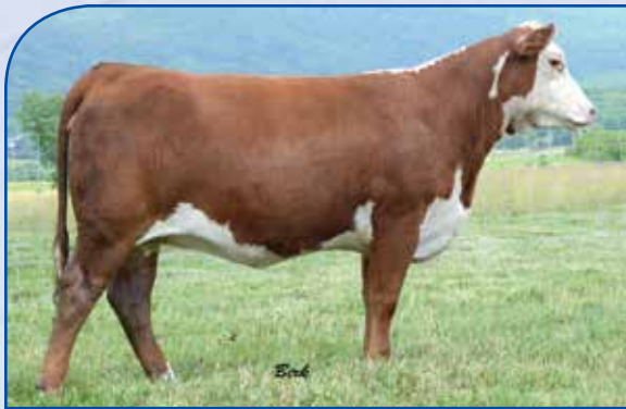
Lot 54 — CHF Princess 3544 ET

CE 5.1 (P); BW 2.3 (.22); WW 62 (.20); YW 96 (.21); MM 25 (.17); M&G 56; MCE 1.9 (P); MCW 86 (.19); SC 1.1 (.18); FAT -0.009 (.19); REA 0.44 (.19); MARB 0.08 (.18); BMI$ 22; CEZ$ 19; BII$ 17; CHB$ 32