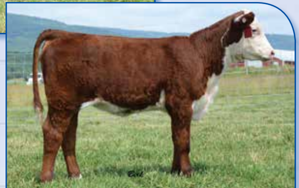
Lot 52A — CHF Christina 4003