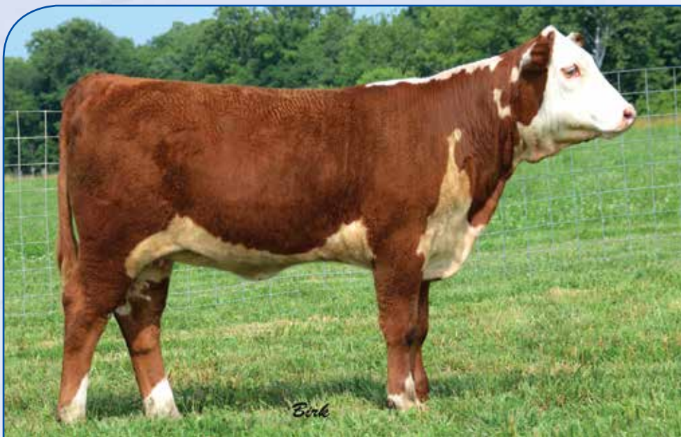
Lot 28B — Grassy Run Fairview 4008

CE -1.5 (P); BW 5.0 (P); WW 54 (P); YW 82 (P); MM 26 (P); M&G 53; MCE -1.3 (P); MCW 91 (P); SC 0.6 (P); FAT 0.012 (P); REA 0.63 (P); MARB -0.01 (P); BMI$ 12; CEZ$ 11; BII$ 10; CHB$ 23