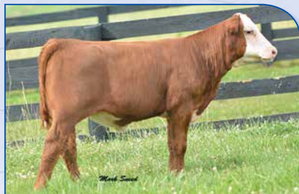
Lot 8A — Boyd Show Girl 4043