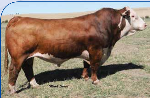
TH 223 711 Victor 755T — Proven sire of Lot 18