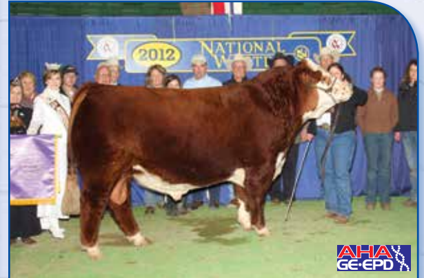
NJW 73S M326 Trust 100W ET — Sire of Lot 67