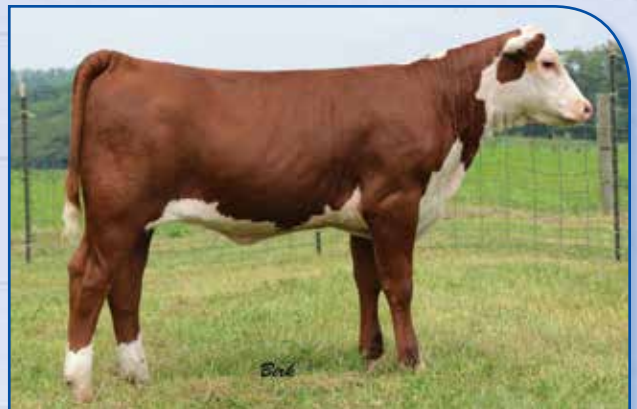
Lot 64A — FSL Lady Rev 4R 3W 32B