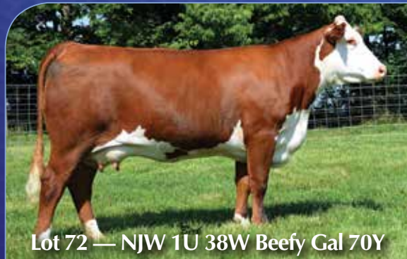
Lot 72 — NJW 1U 38W Beefy Gal 70Y