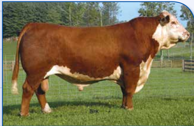
JJD Mr Gold 2001 ET — Sire of Lot 40