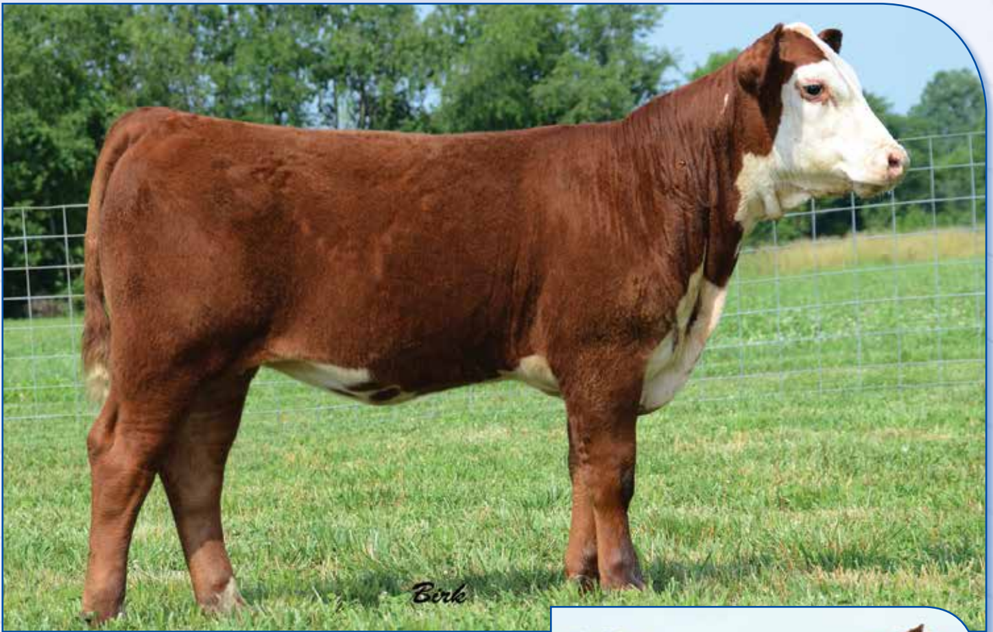
Lot 27A — Grassy Run Rachel 4001