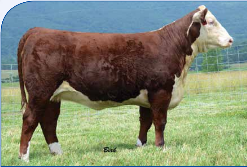
Lot 53 — CHF TTF Pearlene 3513 ET