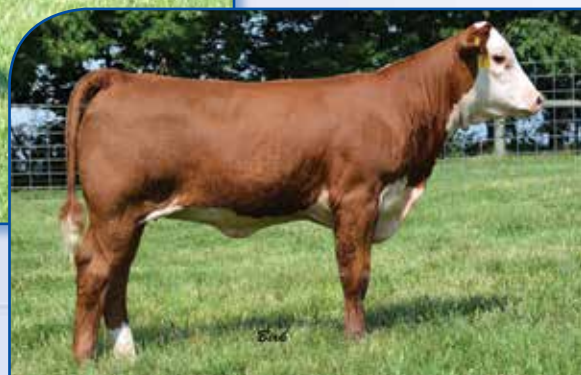
Lot 47A — WOLF Annabelle Y7 B12