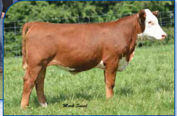
Lot 3A — Boyd 233 Rachel 3134