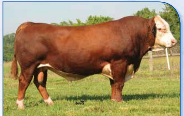
Grassy Run Super Sport 04X ET — Sire of Lot 35A