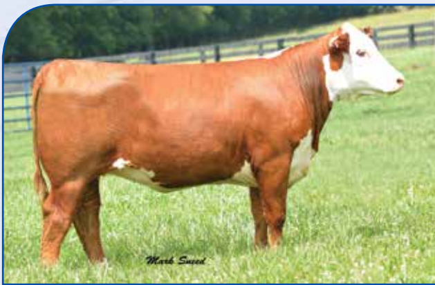
Lot 13 — Boyd Taylor Belle 3062