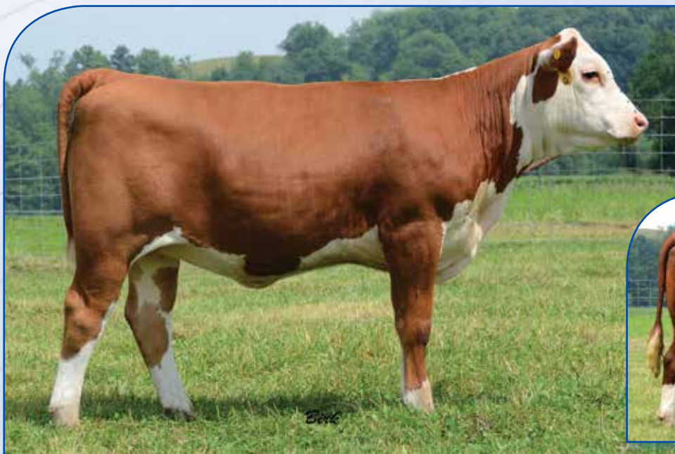
Lot 63A — FSL Lady Rev 4R 17X 10B