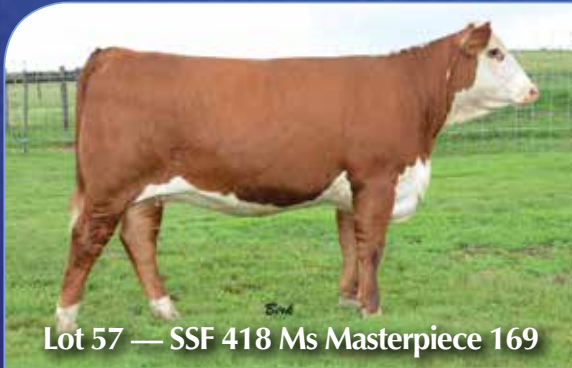
Lot 57 — SSF 418 Ms Masterpiece 169