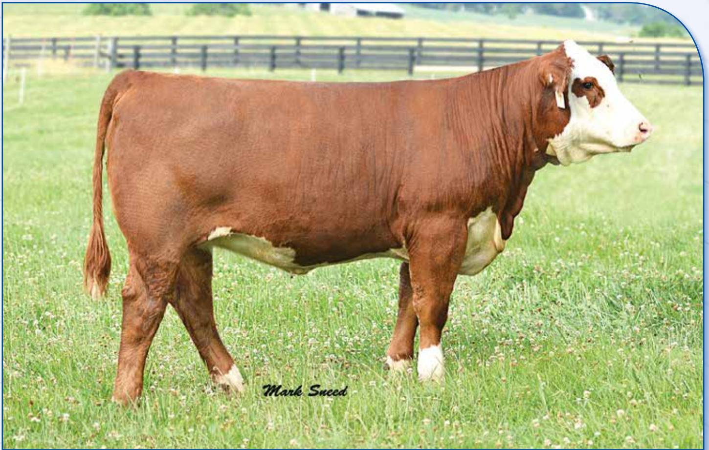
Lot 2A — Boyd 1151 Rachel 3070