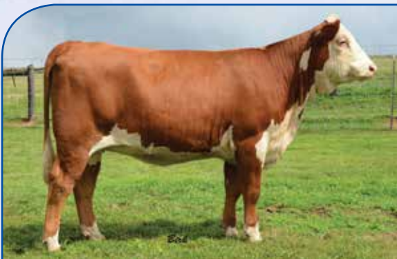
Lot 60 — SSF 359 Lady Shrek 176