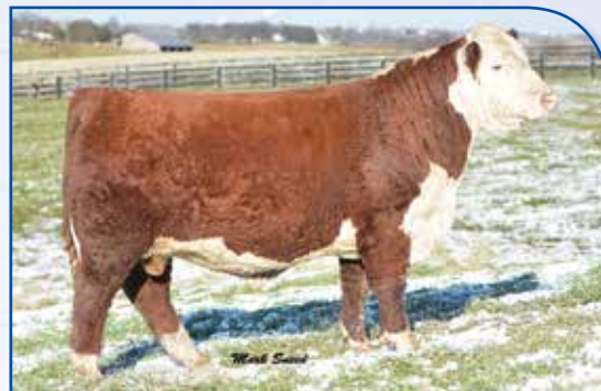
Boyd Legacy 3001 — $55,000 maternal brother to Lot 1 Owned with Wolf Farm and The Legacy Group