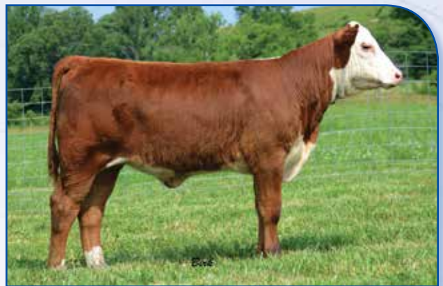
Lot 32A — Grassy Run Fashion 4046