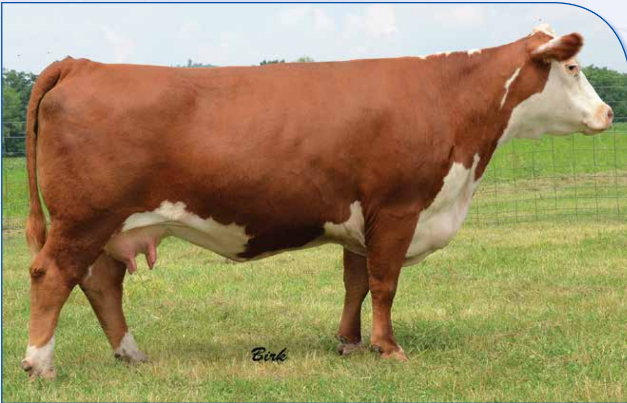
Lot 64 — FSL Miss Ribeye R117 3W