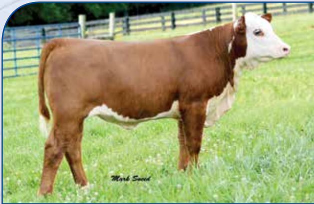
Lot 6A — Boyd Miss World 4017