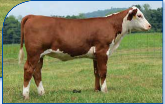
Lot 65A — FSL Lady Rev 4R 14X 39B